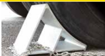
Wheel Chock Safety Systems