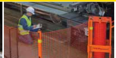
Portable Safety Zone