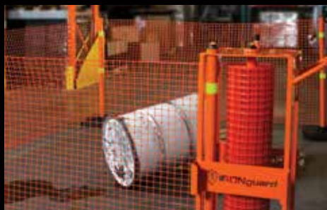
SECURE A TEMPORARY HAZARDOUS AREA