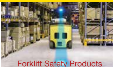
Forklift Safety Products