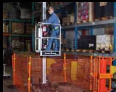
PROTECT MAINTENANCE AND SERVICE PERSONNEL