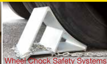
Wheel Chock Safety Systems